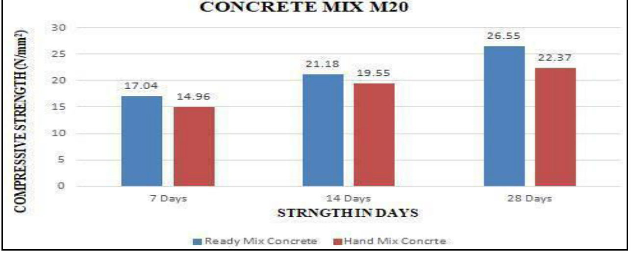
Fig 6.2 : Bar chart showing comparison of RMC & HMC