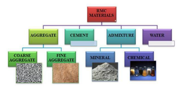
Materials used in RMC